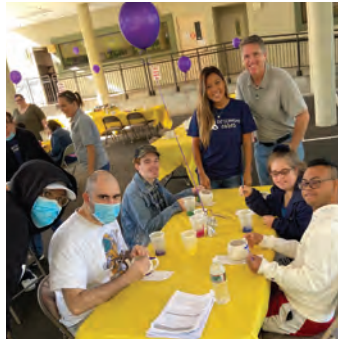
Employees from DeLonghi volunteered with members of STRIVE day program making custom hot-off-the-press paninis and crafts, and, of course, dancing.