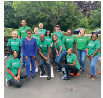
Thank you to volunteers from M&T Bank who spent the day sprucing up our Paramus location.