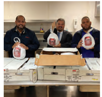
Many thanks to Maschio's Food Service for donating Thanksgiving turkeys to all of our community residences (group homes).