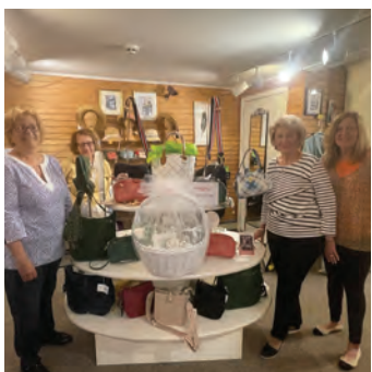
The Depot Gift Shop in Midland Park has been dedicated to the upliftment of women since 1965. Entirely volunteer-run, all proceeds benefit Children's Aid and Family Services. Through the efforts of these amazing volunteers, The Depot has donated more than $3 million to the agency.