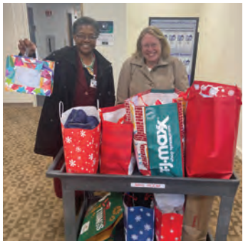
The children, adults, and families we serve had extra special holidays thanks to everyone that participated in our annual holiday gift drive. Pictured are employees from BSAF.