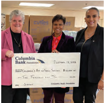
The Baby Basics program is funded entirely by philanthropy. We are grateful to our many donors, including Columbia Bank Foundation, for their support of this vital program.