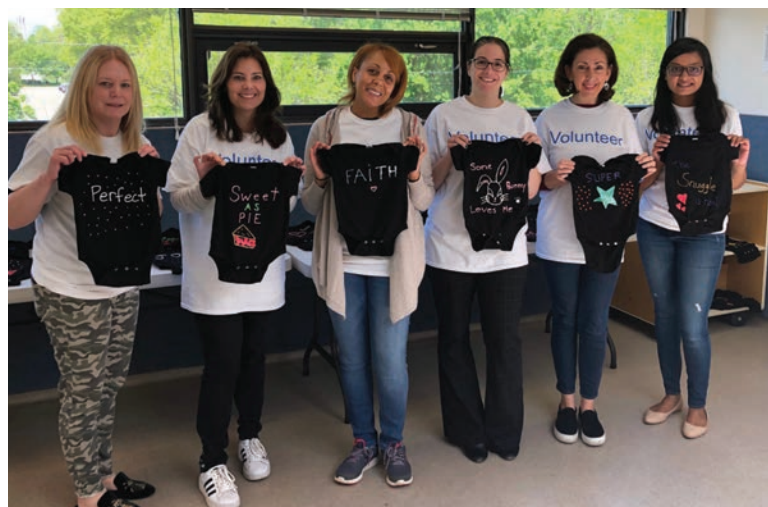
Volunteers from Novartis decorated onesies for our families in the Baby Basics program.