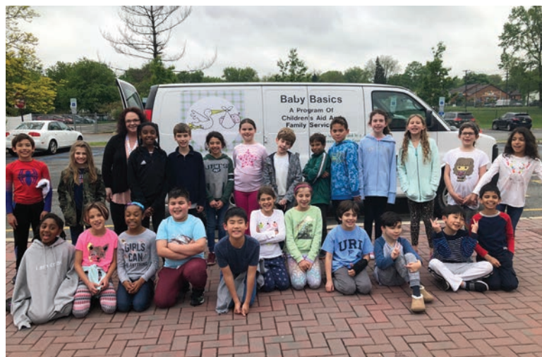
Thanks to students at the Village School for organizing a drive for the Baby Basics program.