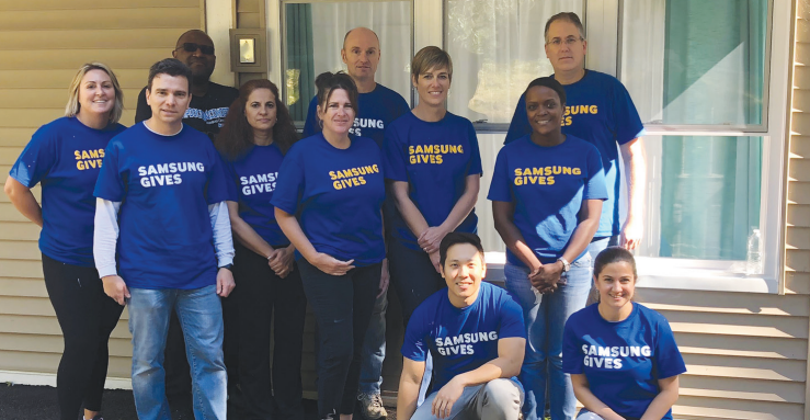
Volunteers from Samsung help us keep our group homes looking their best.