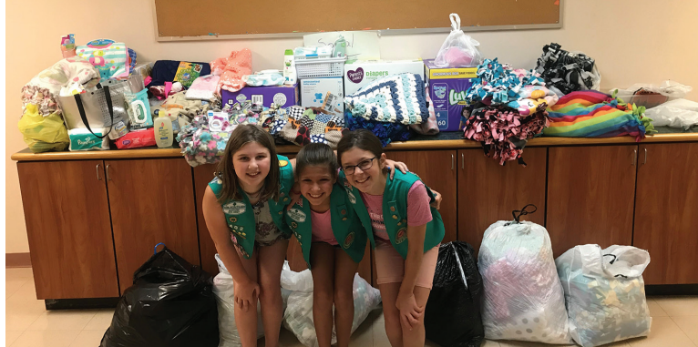
Members of Girl Scout Troop 95402 ran an amazing drive to benefit Baby Basics.