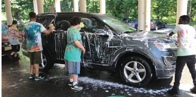
Members of STRIVE Day Program held a car wash to raise funds for a trip to the Bronx Zoo.