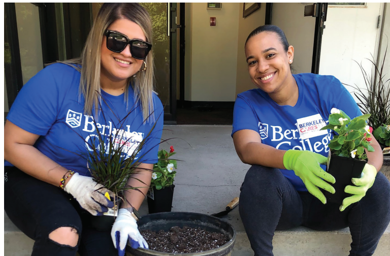
Volunteers from Berkeley College shared their gardening skills.