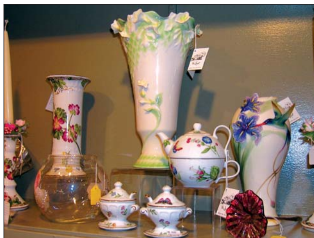
Some of the unique home goods found at The Depot.