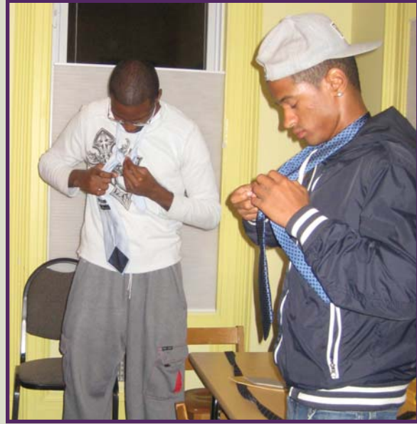
Mastering the art of tying a tie.