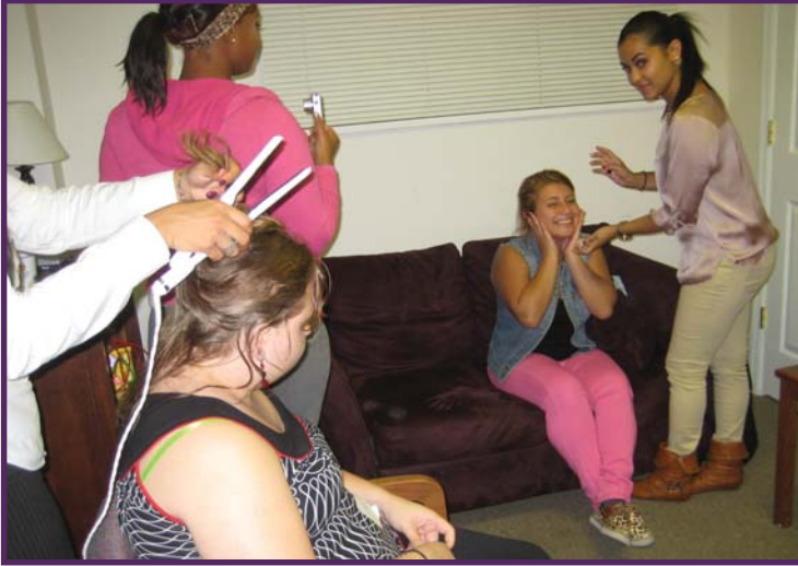
Interview-ready hair and makeup.

young woman wants to be a mechanic and loved working on cars. During the job readiness workshop, two young men had a race to see who could tie their tie the fastest!"