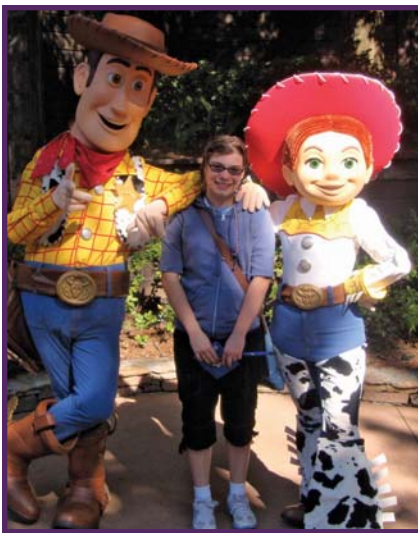
First trip to Disney World.