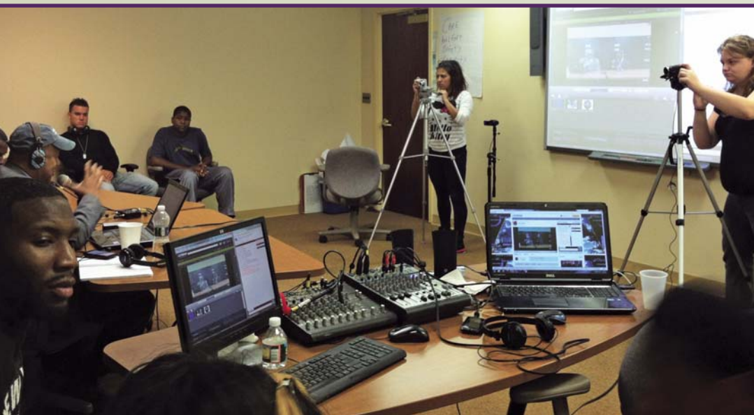
Internet radio production.