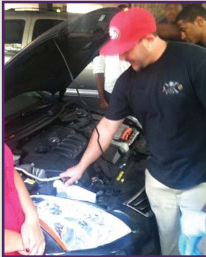
Learning to check oil.

Children's Aid and Family Services is seeking volunteers to lead life skills workshops, especially in the following areas: How to Lower Utilities and Save Energy, Understanding and Securing a Student Loan, Budget Planning, Music Instruction and Money Management. We also need mentors for our children. If you have expertise in any of these areas, or other areas that you think would help our children, please call our volunteer manager at 201.261.2800. Thank you!