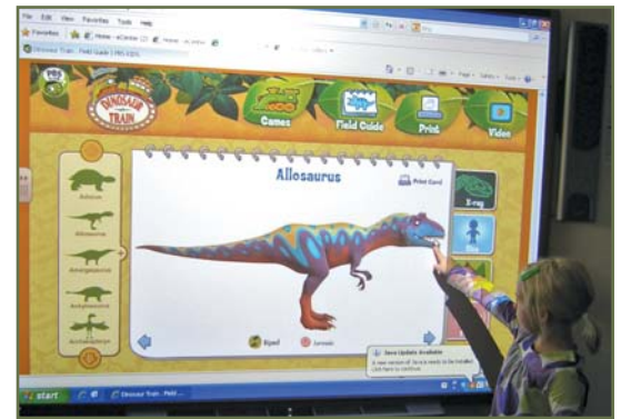
The Turrell Center's kindergarten class learns about dinosaurs during a SMART Board lesson.

SMART Boards are interactive, touch-sensitive whiteboards that run off a local computer system. Teachers and students can use their fingertips to write on the digital board, which also includes access to lesson plans, games and the Internet. The Turrell Center received the SMART Board from a grant from the New Jersey Department of Education.