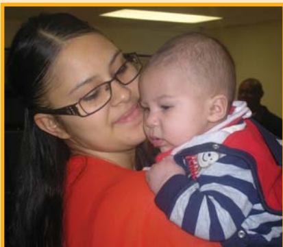
Some of the mothers and children from Zoe's Place.