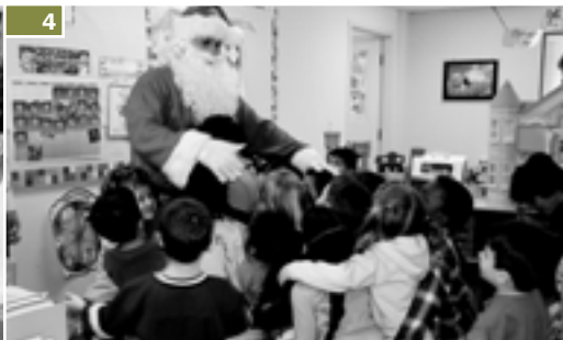
Enterprise rent-a-car's Santa received an enthusiastic welcome from TCDC children during the holiday party.