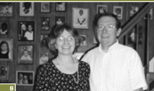
The Campbell's home is filled with photos of all the children in their lives – foster, biological, adopted, as well as grandchildren.