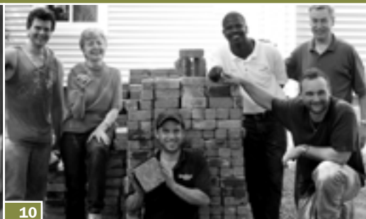
Volunteers from Ridgewood A.M. Rotary and the NJ Landscape Contractors Association build a patio for the little girls.