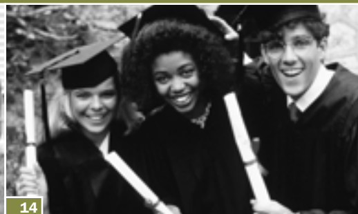
Kudos to all of the residents of our group homes and foster homes who graduated high school this year.